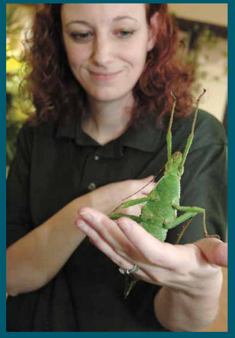
An Academy educator displays a live specimen of a Jungle Nymph, a large stick-insect species from Malaysia.