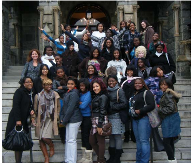
The 2009 College Tour took the WINS to Trinity College, Howard University, George Washington University, Georgetown University and University of Maryland Baltimore County. The WINS can be seen above on the steps of the Healy Building in Georgetown which dates from 1789.